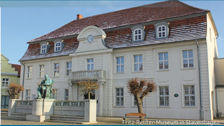
Fritz-Reuter-Museum in Stavenhagen