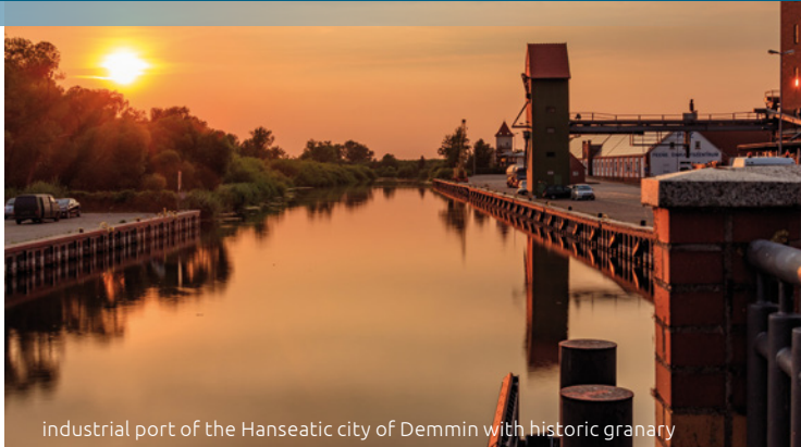
industrial port of the Hanseatic city of Demmin with historic granary